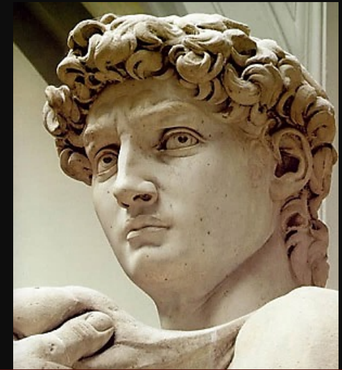
King David, M. Angelo