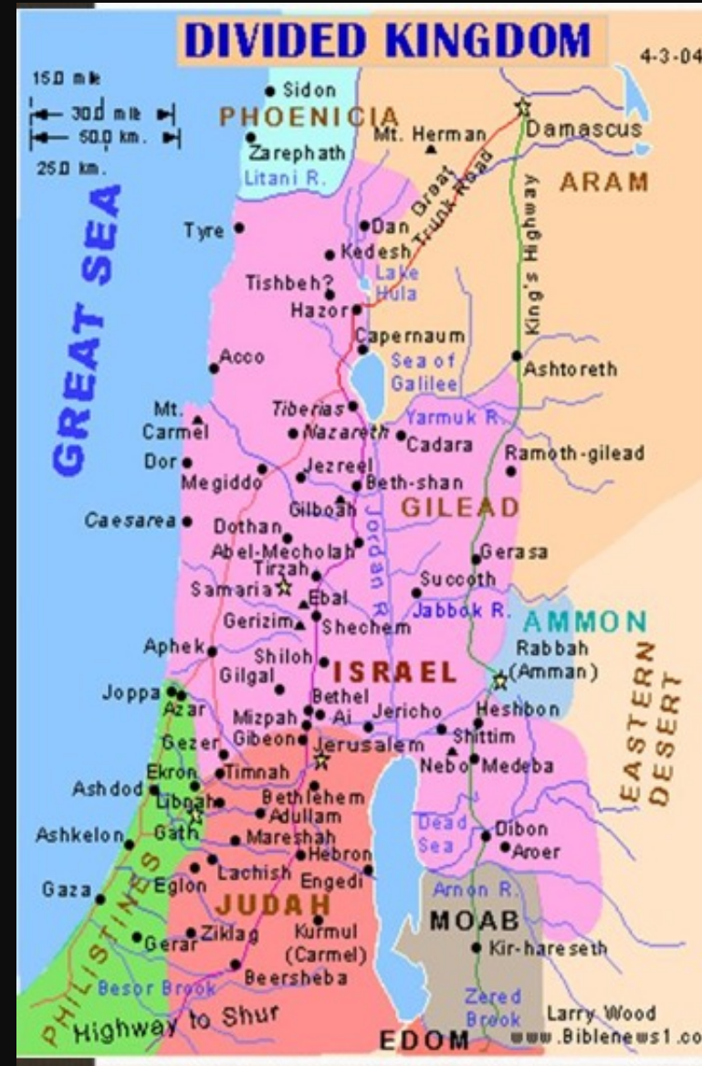
Divided Kingdom after Solomon 900s – 800s BCE