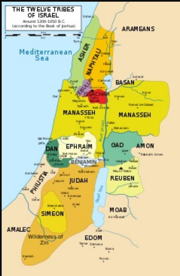
Kingdom of United Israel 1100s – 900s BCE