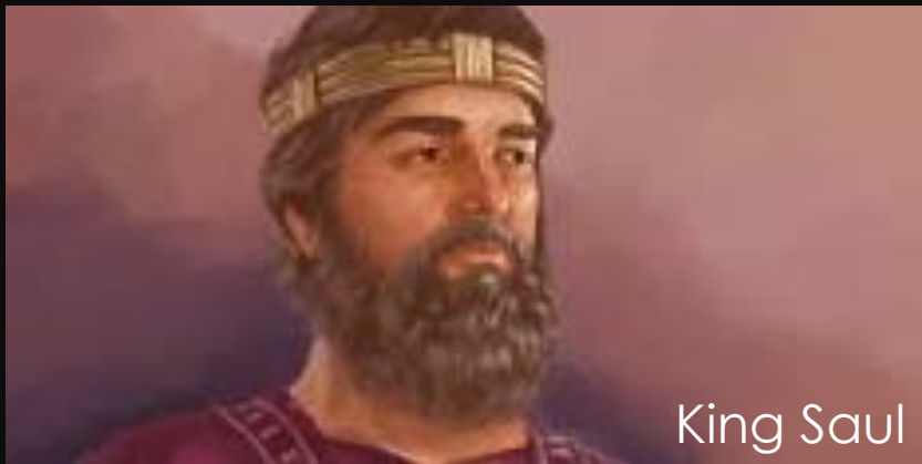
An Imaginary image of King Saul