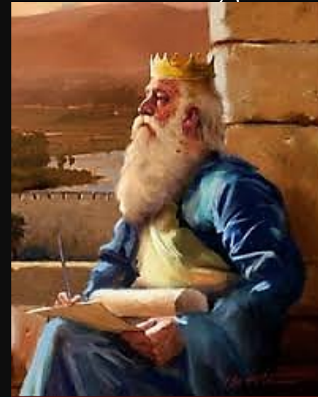
An Imaginary image of King Solomon