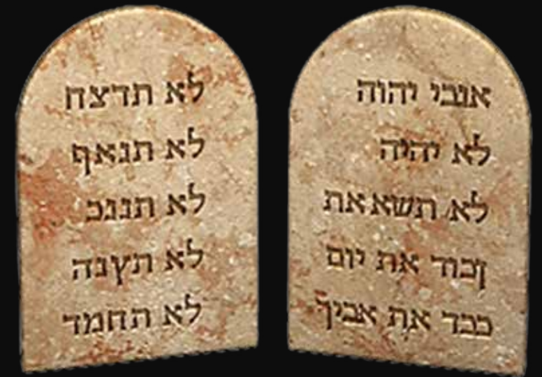
The Ten Commandments