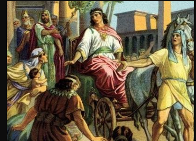
An Imaginary image of Joseph