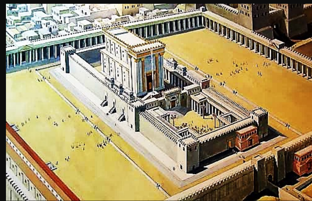
King Solomon's Temple