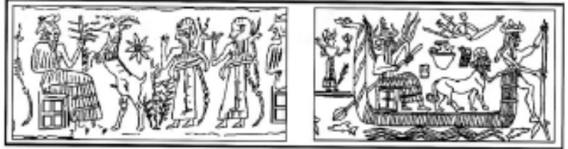
Akkadian seal impressions: the world of the gods.